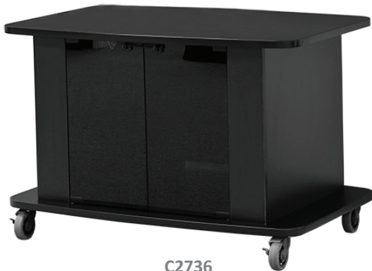
C2736 (Cart Only)

The Tech Series monitor cart model C2736 will accommodate single 37" to 60" monitors using the optional PM2-S mount, single XL 60" to 90" monitors using the optional PM2-XL mount or dual 42" to 70" using the optional PM2-D mount. Tech Series carts have a wide wheel base that provides an extra measure of safety for heavy or oversized monitors, etc.